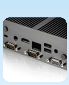
extra VGA port and two serial ports